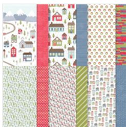
Trimming The Town Designer Series Paper - 153491