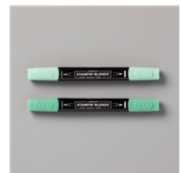
Just Jade Stampin' Blends Combo Pack - 153107