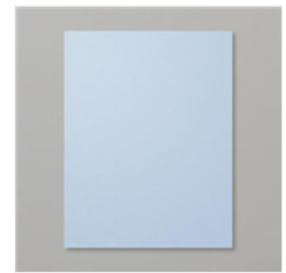
Seaside Spray 8-1/2" X 11" Cardstock - 150883