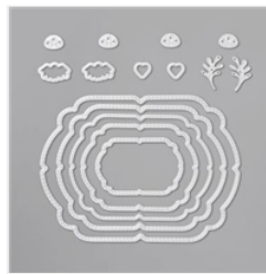
Celebration Labels Dies - 153570