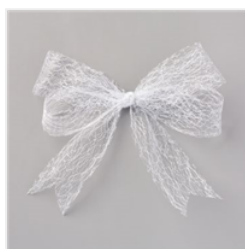
1-1/2" (3.8 Cm) Metallic Mesh Ribbon - 153550