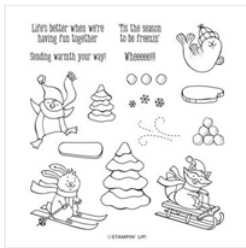
Freezin' Fun Cling Stamp Set (English) - 153341