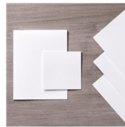
Whisper White 8-1/2" X 11" Thick Cardstock - 140272